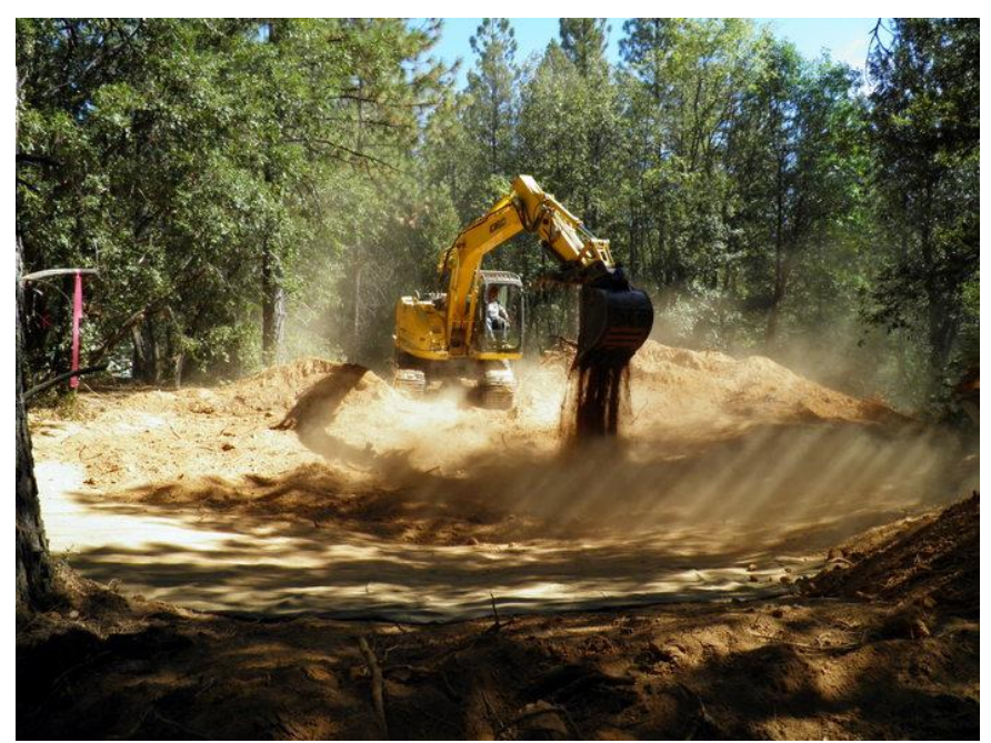
The excavator is used to place soil over the liner and geo-textile pads. Heavy equipment must be kept off of the liner at all times to protect it from damage.