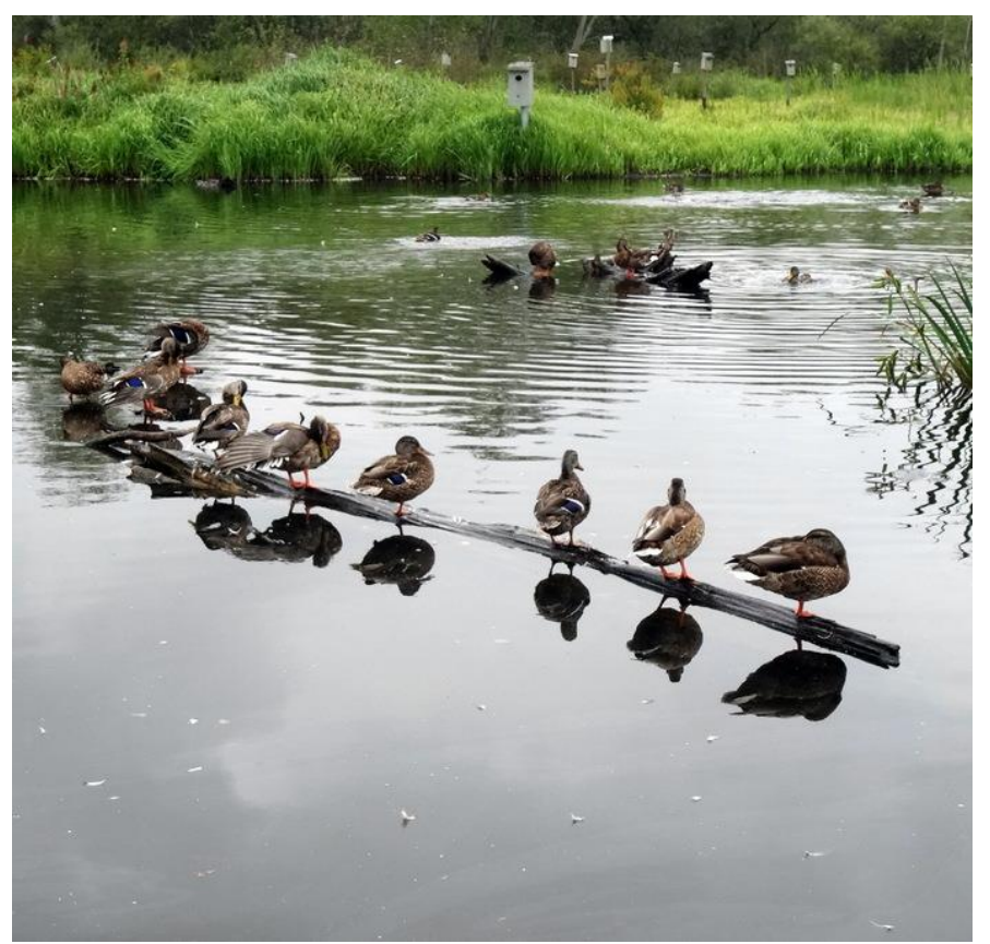
Logs would be placed in the wetlands to provide loafing sites for waterfowl.

Large logs, branches, and root masses would be placed in the wetlands to improve habitat for the California red-legged frog, invertebrates, and a diversity of plants and animals. Branches of various diameters and lengths would be placed in the wetlands to provide egg attachment sites for amphibians, and improved habitat for invertebrates.