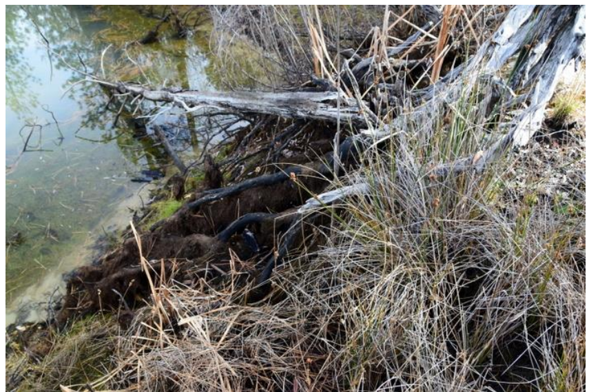
The roots, branches, and logs in the ponds at the Big Gun Conservation Bank provide places for the California red-legged frog to hide when they are filled with water.