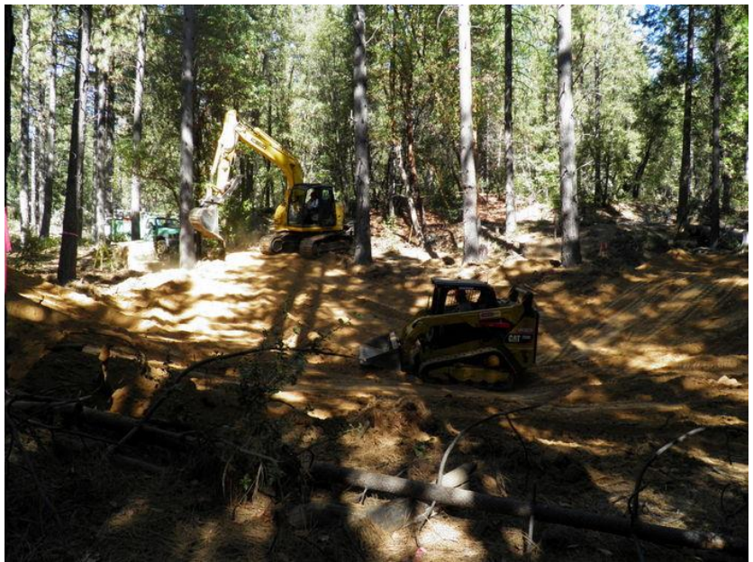
An excavator and a skid steer working together is an effective way of building wetlands that require the use of liners

John Deere 210G Minimum 42-inch wide bucket (1.0yd<sup>3</sup>) or larger 159HP or greater 52,09lbs minimum operating weight Working thumb attachment (important for moving logs, woody debris, and rocks) No more than 10-years old (less likely to leak oil and breakdown)