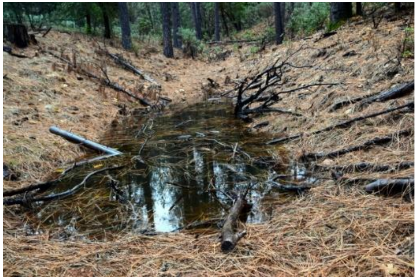
This small wetland was built on higher ground in only one-half day near a tributary to Bear Creek on the Eldorado National Forest in 2014.

The Forest Service is interested in establishing naturally appearing and functioning wetlands to benefit the California red-legged frog and other species. Returning wetlands to the landscape would also reduce erosion, clean run-off, and control flooding. Wetlands would provide nesting habitat for waterfowl and shorebirds, stopover habitat for migratory birds, breeding and foraging habitat frogs and toads, foraging habitat and water for bats, breeding and foraging habitat for aquatic insects, and drinking water for many other species of wildlife. The project would improve habitat for the western pond turtle, and western toad. Hunters would be thrilled to see how deer, black bear, and Wild Turkey make great use of constructed wetlands.