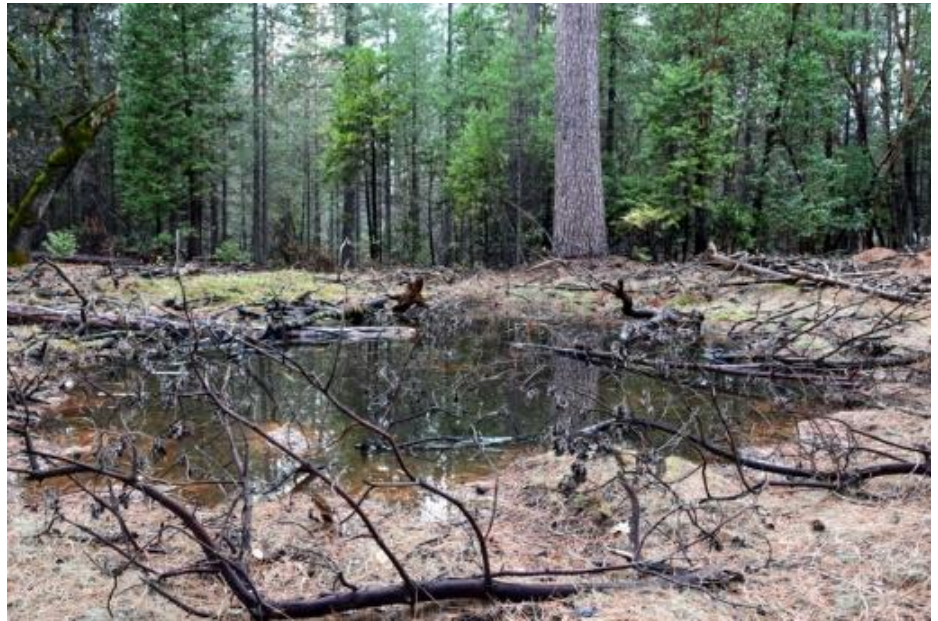
This wetland is one of seven built on the Eldorado National Forest in October 2014. The wetland is 14-months old in this photo.