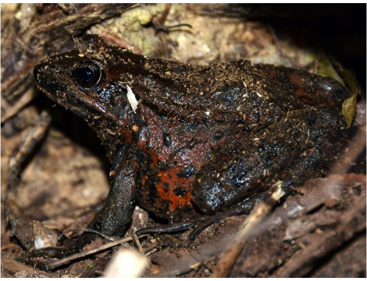
California red-legged frog