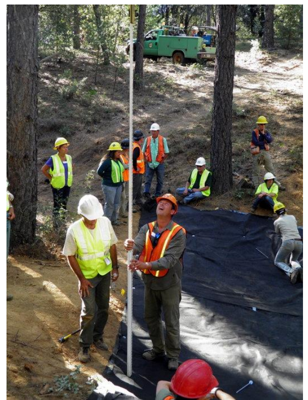
A wetland workshop was held in 2014 where participants helped with the construction of 3wetlands on the Eldorado National Forest.