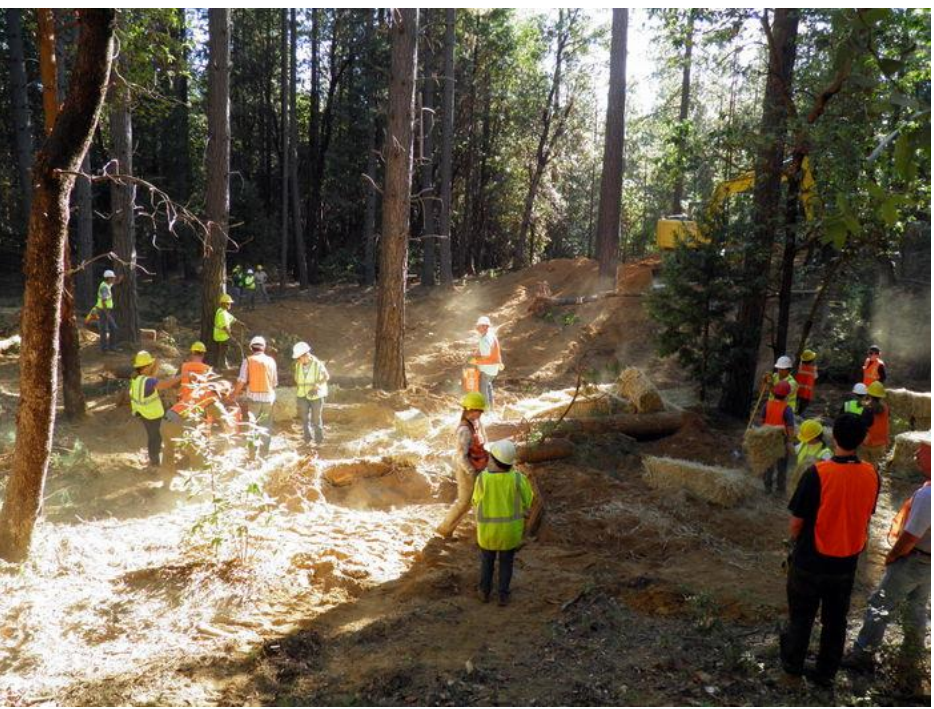
Wheat and native plants are sown, and straw is spread for mulch the same day each wetland is built to prevent erosion, and reduce colonization by nonnative plants.