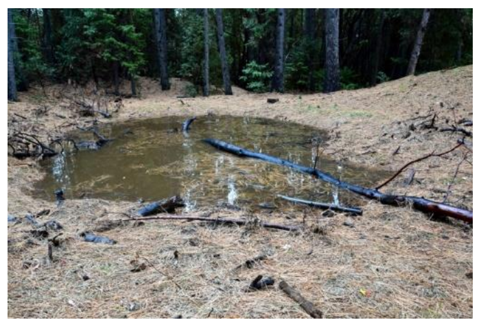
The wetland shown in this photo was built by people attending a wetland restoration workshop on the Eldorado National Forest near Bear Creek in 2014.

Wetlands are areas of shallow water that provide habitat to many species of plants and animals. One is likely to see mule deer, wild turkey, turtles, and dragonflies while visiting a wetland. Wetlands may contain water all year, or for only part of the year. Wetlands are considered to be the most biologically diverse of all ecosystems. Forty-three percent of all species listed as threatened or endangered in the United States by the U.S. Fish and Wildlife Service depend on wetlands for their survival. Experts report that less than one-half of the wetlands in the contiguous 48 United States remain. Over 91-percent of the wetlands in California were lost to drainage from the 1780s to 1980s.<sup>3</sup>